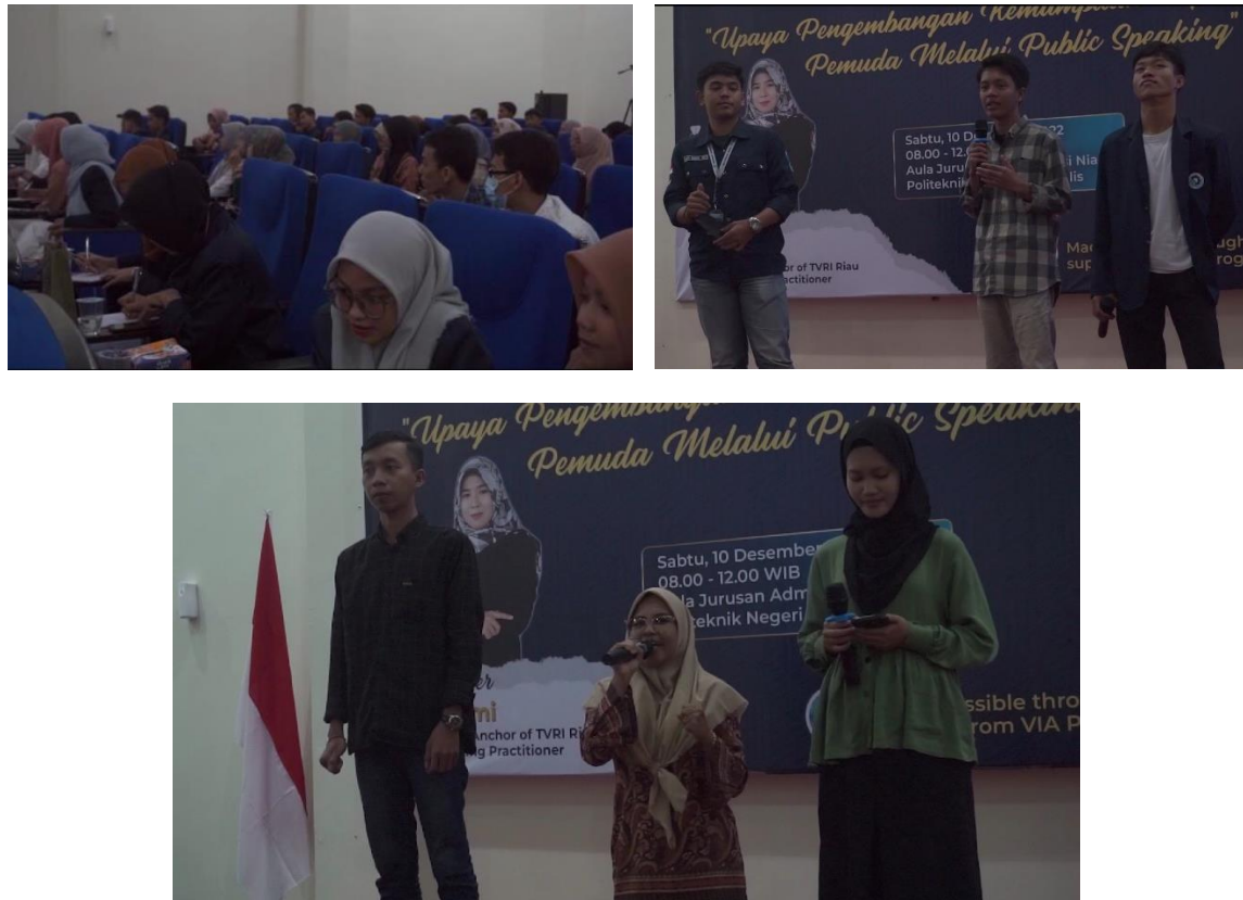
Figure 4. Group Practice of Public Speaking

After explaining the theory regarding public speaking, the trainer allowed the participants to have small group practice. Then, the groups were asked to perform public speaking on the stage. The participants' public speaking skills were analyzed through the implementation of foundation and techniques of public speaking they performed. The depiction of the activity can be seen in Figure 4.