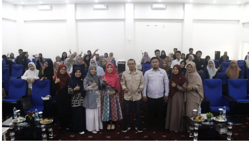
Figure 5. Persons in Charge, Stakeholders and Participants of Workshop